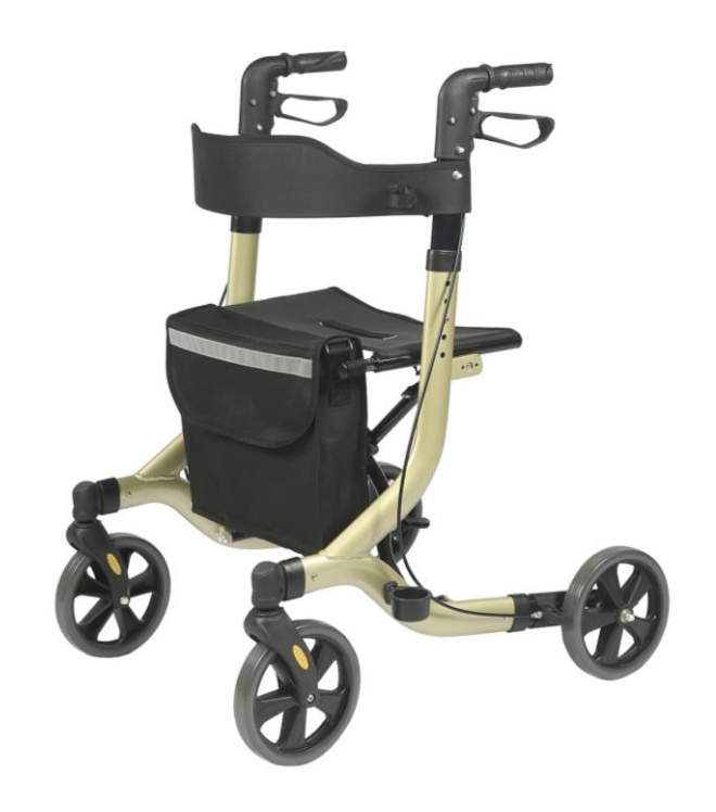
Usage and Maintenance Instructions